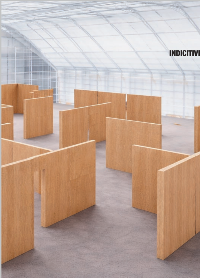
INDICITIVE RENDER OF 2027 CONCEPT